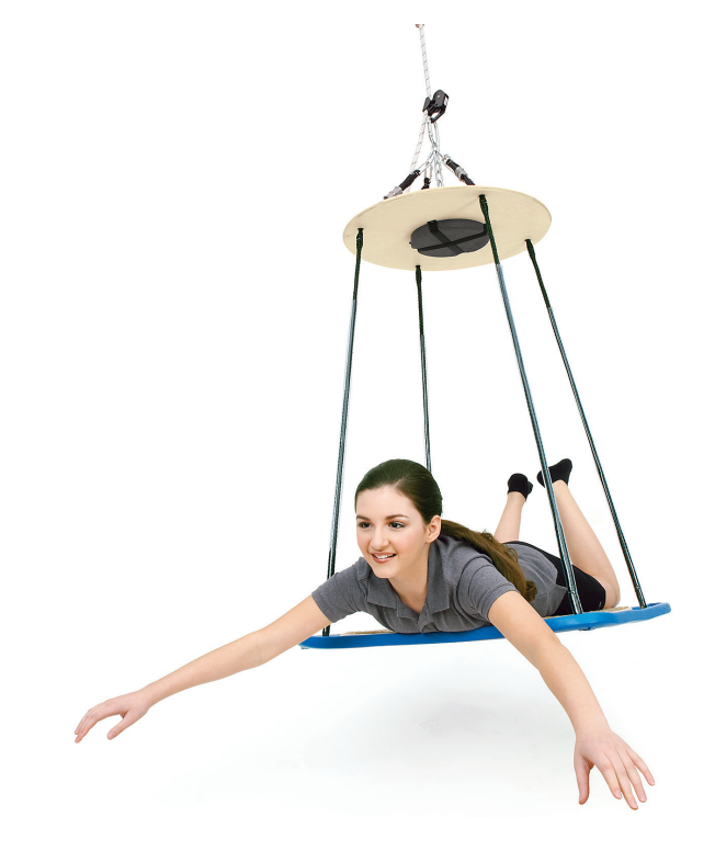
MODIFIED PLATFORM SWING

SCOOTER BOARD RAMP & ADVANTAGE LINE SCOOTER BOARD Easy to assemble, lightweight and easy to store. With the attached rope children can scoot down and pull themselves back up again.