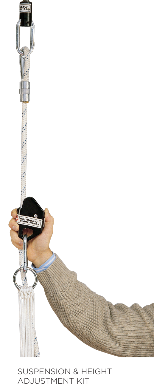
SUSPENSION & HEIGHT ADJUSTMENT KIT The suspension & height adjustment kit includes: 1x Safety Snap 1x Safety Rotational Device 1x Rope with Eye Splice 1x Height Adjuster

This can be used to suspend all swings from the ceiling suspension point.