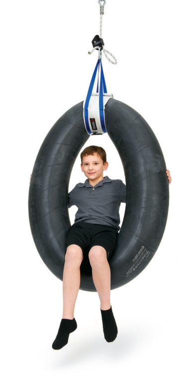
TUBE SWING COMPLETE